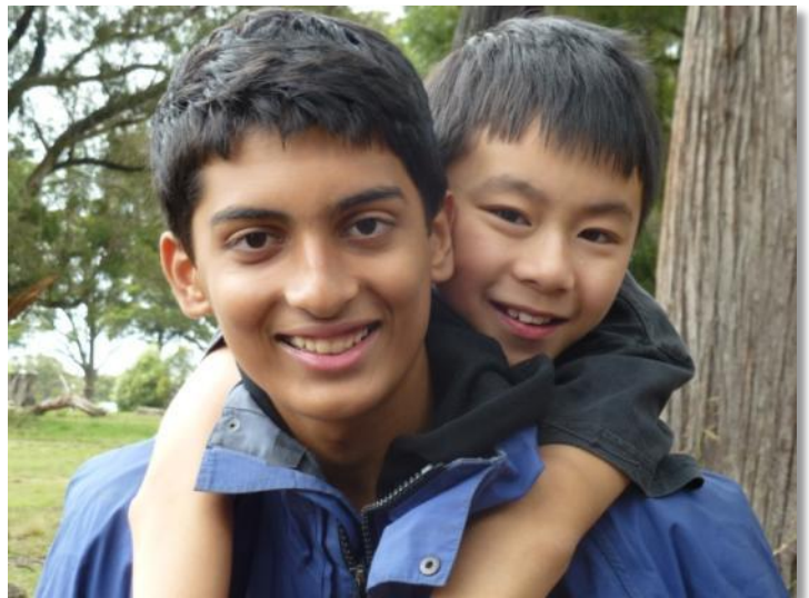
Year 7 student with his Peer Support Leader on Year 7 camp

Our parents are actively involved in the school through the School Council, P&C, Auxiliary, Falcon Sport and Falcon Foundation. They are passionately committed to the school and we greatly appreciate their involvement.